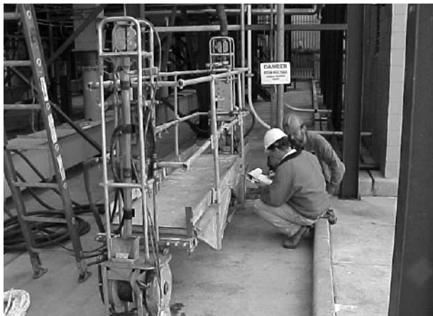
ST-26 attached to platforms