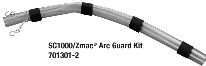
SC1000/Zmac® Arc Guard Kit 701301-2