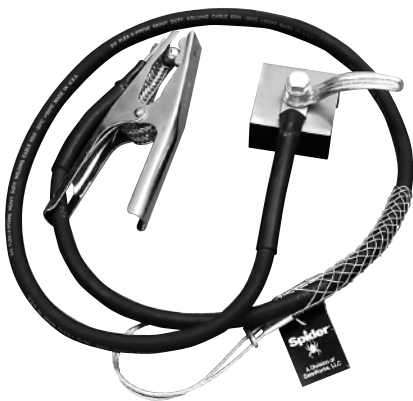
Welding ground 701151-1

Also Available: Traction Hoist Arc Guard Kit For SC30/SC40 701301-1