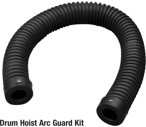
Drum Hoist Arc Guard Kit